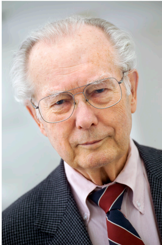
Watt W. Webb.

Webb's entry into biophysics in the early 1970s was driven by a tantalizing challenge: How to measure the kinetics of chemical reactions without displacing them